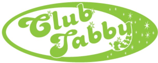
Single color logo - GREEN