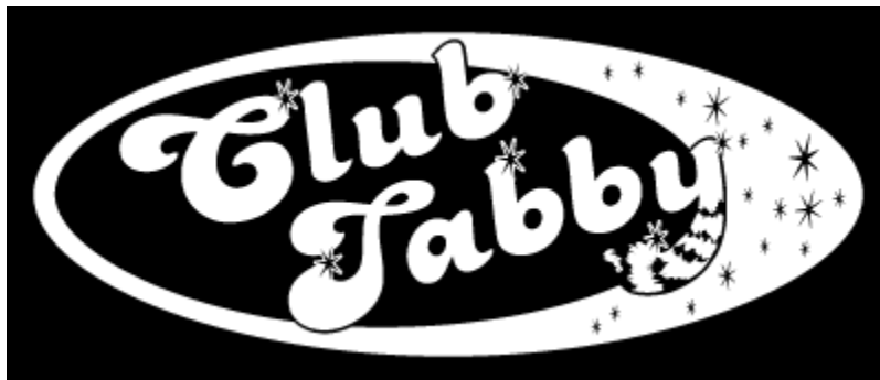
B&W logo on black background

A negative version of the logo may be produced in white when used on a dark or black background.