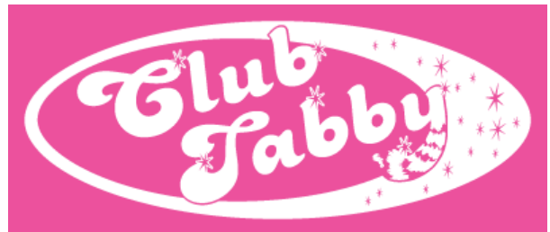
Single color logo - WHITE on PINK background