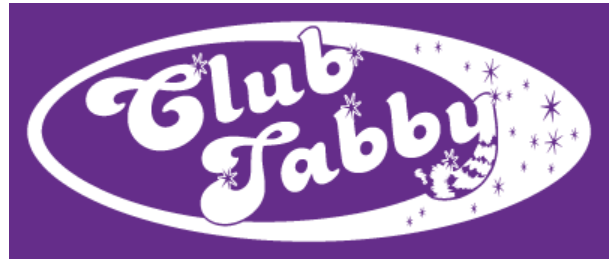
Single color logo - WHITE on PURPLE background