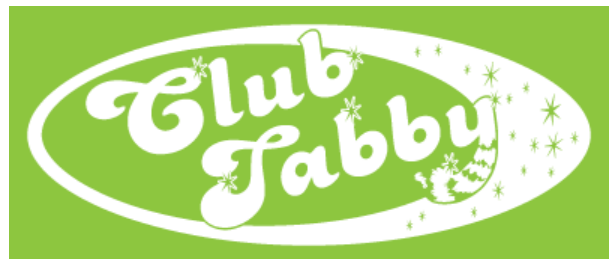
Single color logo - WHITE on GREEN background