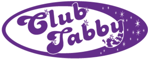
Single color logo - PURPLE

Single color versions as long as they are done in approved Club Tabby colors of PURPLE, PINK or GREEN (see "Color Usage" for exact colors)