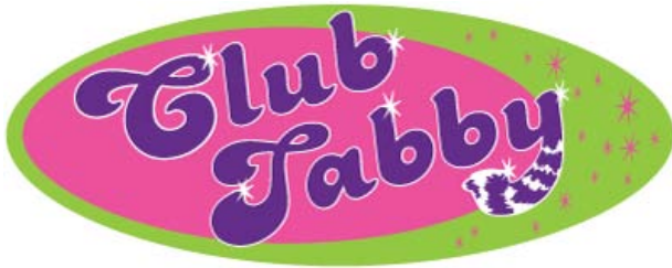
Full Color Logo