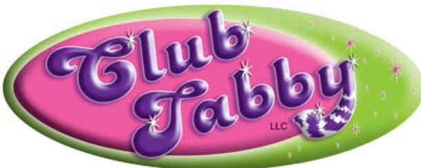
Full Color 3D Logo