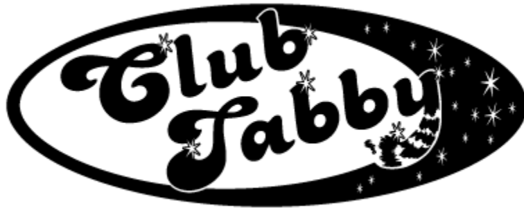
B&W logo on white background

The logo can also be produced in black for black-and-white applications.